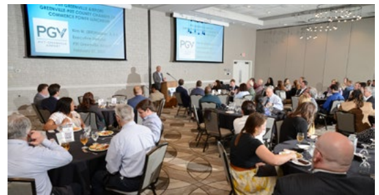
Power Luncheon Series