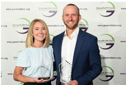
Small Business Awards