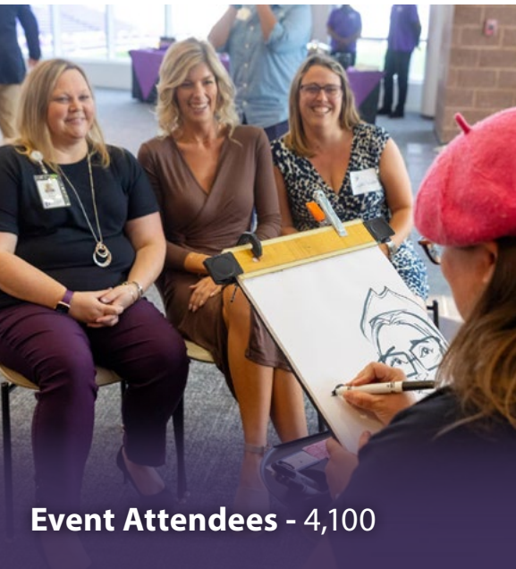
Event Attendees - 4,100