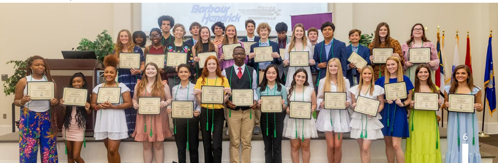
Teen Leadership Institute Class of 2023

The chamber's Teen Leadership Institute , presented by Barbour-Hendrick Honda Greenville , provided Pitt County high school students (sophomores and juniors) with opportunities for growth in leadership and community awareness. Participants took part in five program sessions (one session per month), from November - April, with each session focusing on a specific area of leadership growth and community awareness. Thirty-seven (37) students successfully fulfilled the requirements of the program and were honored with graduation certificates and chords during a ceremony at the Goess Student Center on the campus of Pitt Community College.