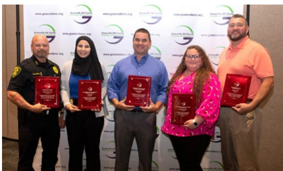
First Responders Appreciation Dinner

The chamber hosted 20 business leaders for its Chamber Day at the State Capitol , presented by the Greenville-ENC Alliance , on May 3, 2023. Participants visited with members of Pitt County's legislative delegation and other state representatives, at the Legislative Building in Raleigh, to engage in candid discussion regarding various legislative priorities for members of the Greenville-Pitt County business community.