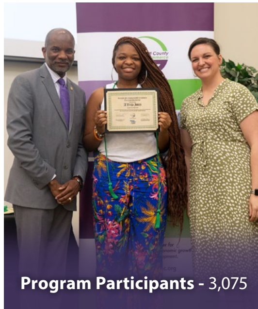
Program Participants - 3,075