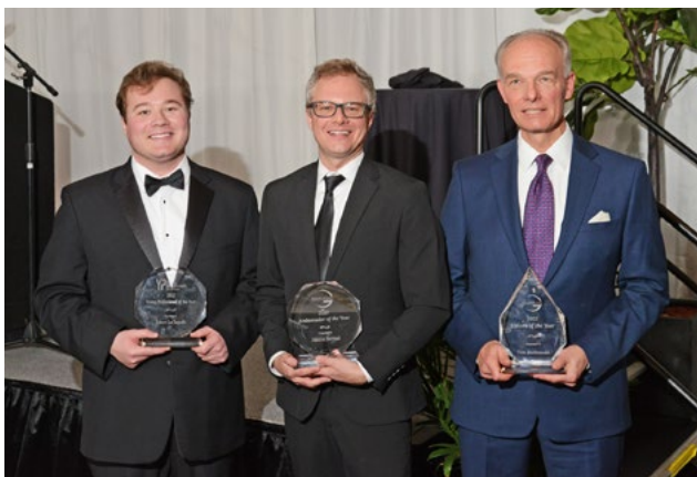
Annual Membership Celebration