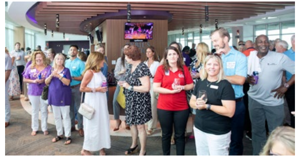
Business After Hours (Monthly)