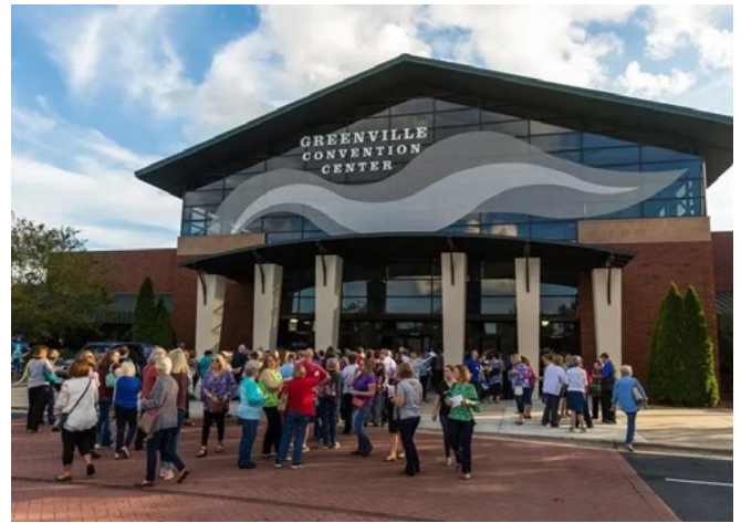
Better Skills, Better Jobs Career Fair - October 5, 2023

The chamber continued its efforts to promote Economic & Workforce Development through active collaboration with various partner organizations. The chamber was a sponsor of the third annual "Better Skills, Better Jobs" career fair on October 5, 2023, at the Greenville Convention Center. Better Skills, Better Jobs is the largest job fair of its kind in eastern North Carolina and focuses on addressing workforce development needs. The chamber provided regional leadership through its collaboration with chambers of commerce in the eastern region, working closely with leaders in New Bern, Kinston, Wilson, Rocky Mount, Zebulon, and Goldsboro. Strong relationships with its economic and workforce development partners reflects the chamber's belief that all members should stay informed and support efforts to enhance Pitt County's economic development initiatives.