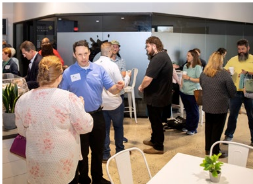
Coffee & Connections (Bi-Monthly)