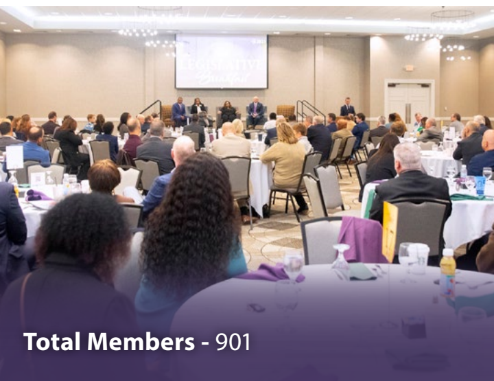
Total Members - 901