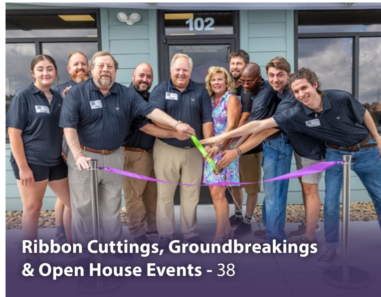
Ribbon Cuttings, Groundbreakings & Open House Events - 38