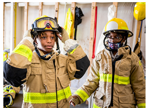
Grow Local Week