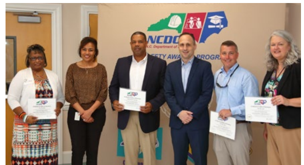
Safety Awards Luncheon