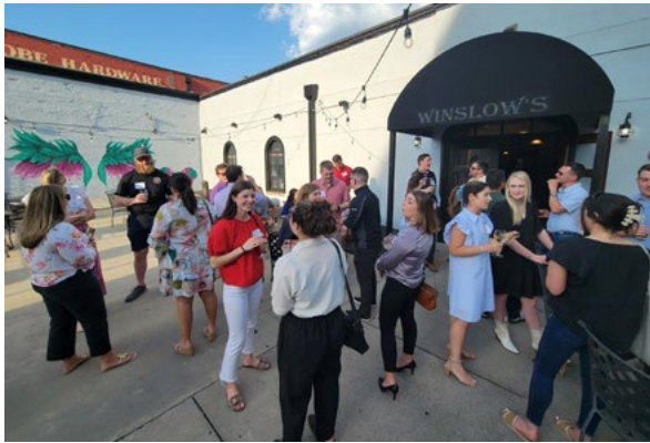
Young Professionals of Pitt County