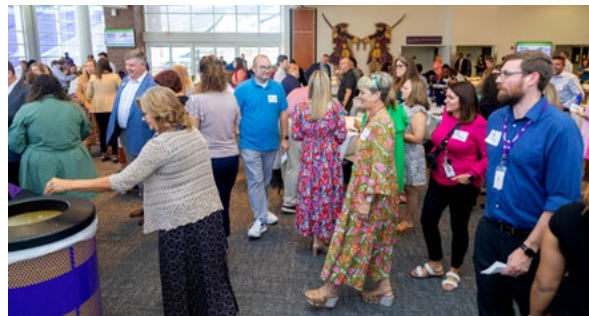
Education Network Reception