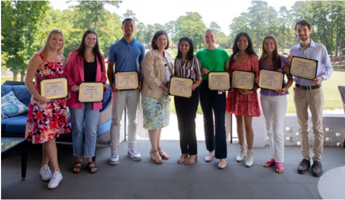
Intern Experience - Wrap Up Celebration

The chamber's Intern Experience , presented by the City of Greenville , was an initiative designed to engage college interns with different facets of the community, in the effort to recruit and retain talent for future success. Over a six-week period, the program equipped participants with valuable skills to take with them as they enter the workforce and entice them to fall in love with Greenville-Pitt County and the companies with which they are interning. Fourteen (14) participants successfully completed the program and were awarded certificates during a wrap-up celebration at Brook Valley Country Club.