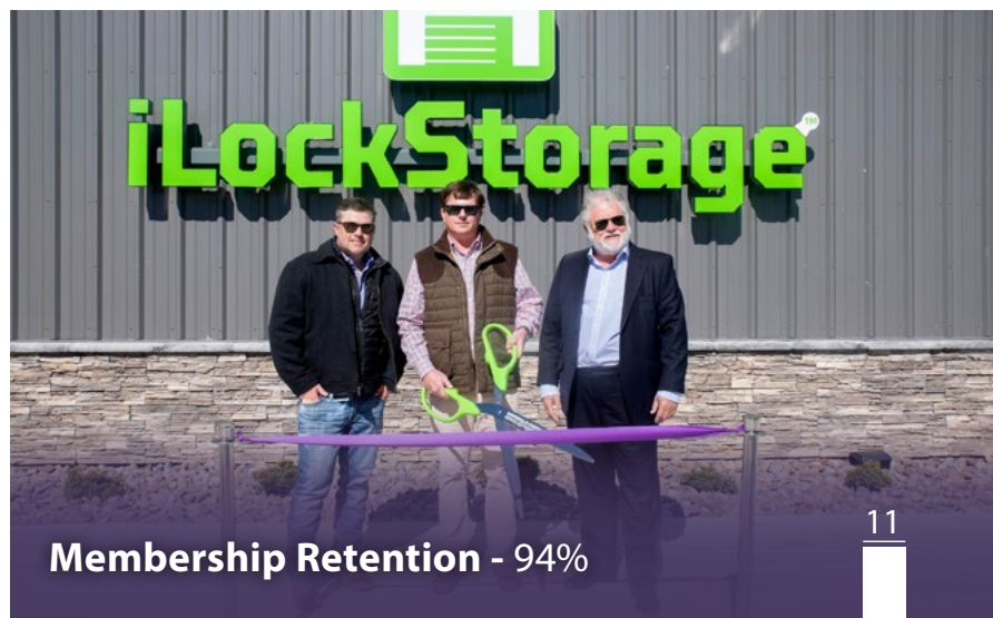
Membership Retention - 94%