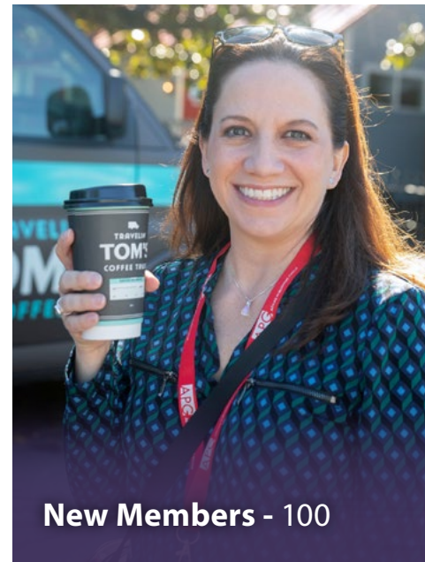
New Members - 100