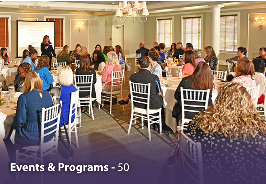
Events & Programs - 50