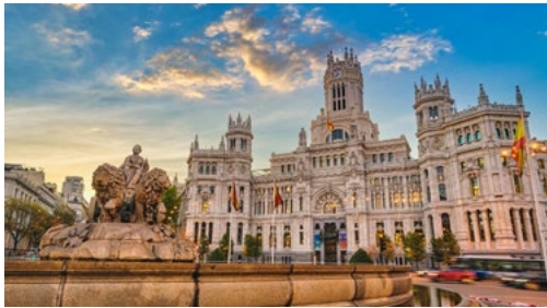
Chamber Trips - Spain

The chamber organized affordable international and national trips for both its members and the public, offering travelers an opportunity to explore the global economy and experience what other parts of the world have to offer. These distinctive trips offered participants an enriching cultural and educational experience, while also promoting connections among local business professionals and retirees. In March, the chamber arranged a trip to Spain/Portugal, followed by a journey to Yellowstone in July.