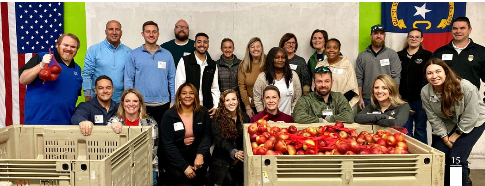
Leadership Institute Class of 2024