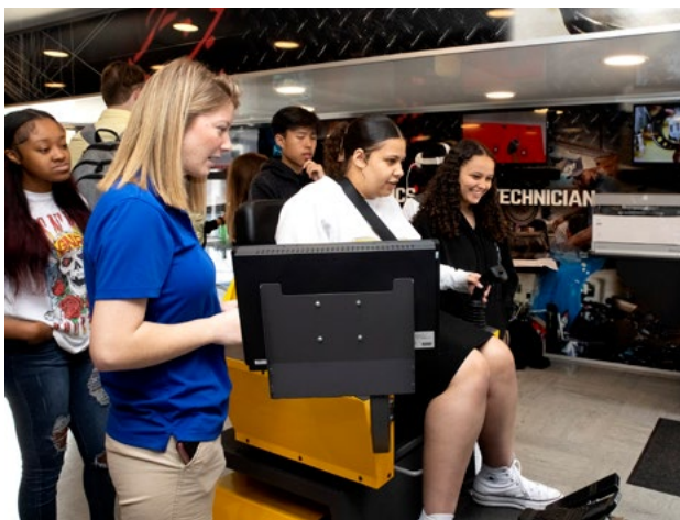
Grow Local Week - March 27-31, 2023

Over 2,930 students participated in the chamber's Grow Local Week , held March 27-31, 2023. Grow Local is a workforce development initiative designed to create and unveil career interests, grow the talent pipeline, and connect local businesses to future employees. Eighty-six (86) Pitt County businesses opened their doors to host middle and high school students during the week-long program. The Be Pro Be Proud Mobile Workshop experience, on the campus of Pitt Community College, was a new inclusion to Grow Local in 2023. Be Pro Be Proud delivers a ground-breaking set of tools and resources designed to help students explore, plan, and launch careers in today's technical roles. Grow Local program partners in 2023 included Catalent , the Greenville-ENC Alliance , Pitt County Economic Development , and Pitt County Schools .