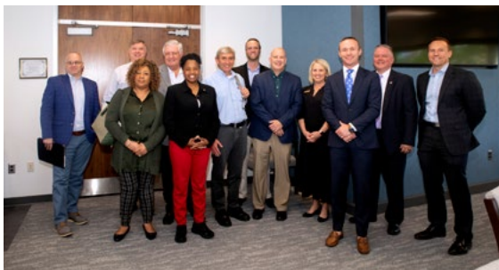
Chamber Day at State Capitol