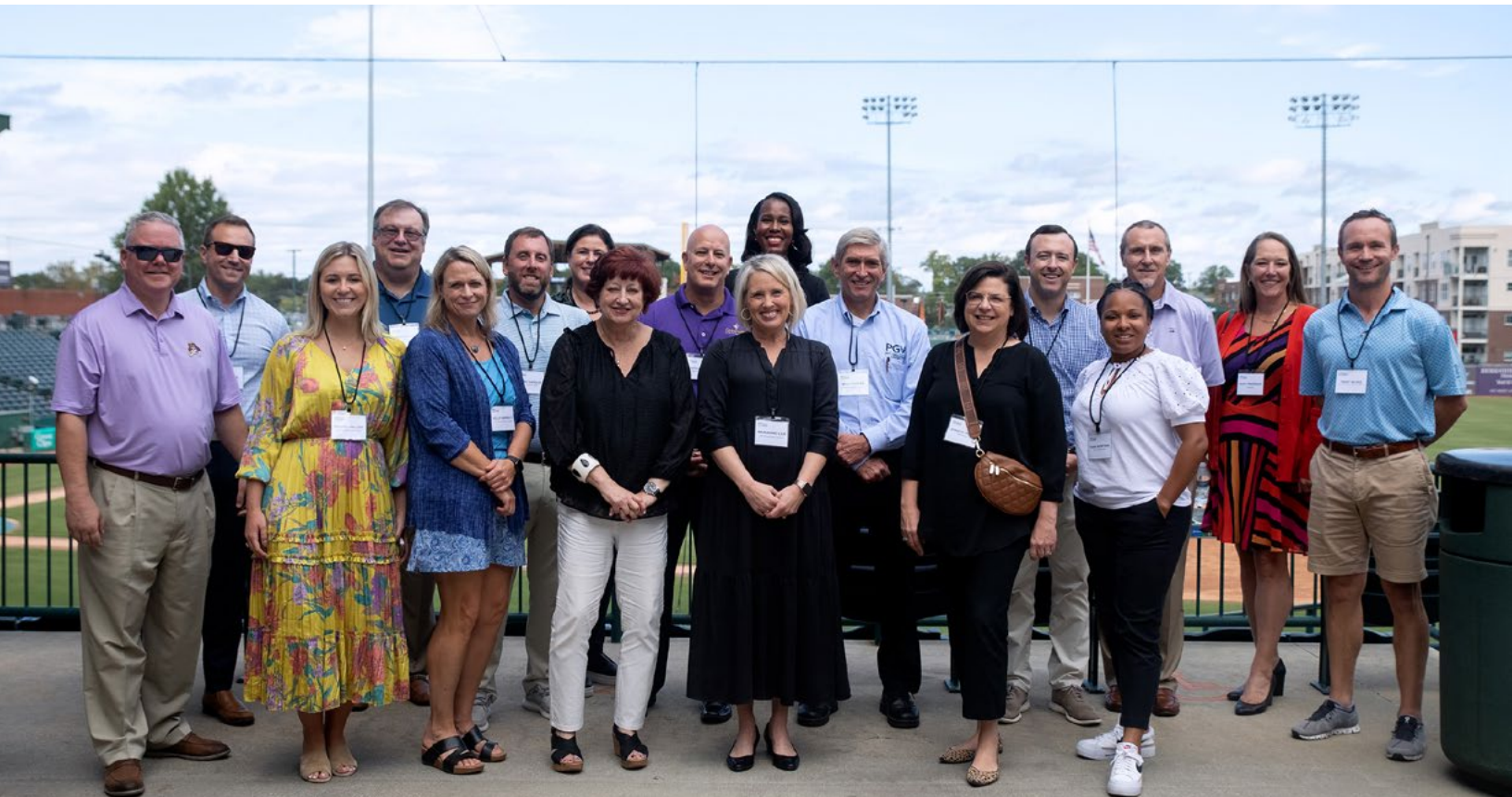
Intercity Visit - Greensboro, NC

The chamber hosted 26 business leaders during its Intercity Visit to Greensboro, NC, September 24-26, 2023. The intercity visit, presented by Catapult , allowed participants to explore best practices, benchmark a comparable community against ours, and enjoy high-level networking with other attendees. The intercity visit also helped identify some of the key challenges facing Greenville, Pitt County, and eastern North Carolina, while also learning how large economic development wins changed the Greensboro landscape. The Greensboro-High Point MSA has experienced growth at unprecedented rates and has several organizations working together with equal voices to manage projects, share leads, and conduct research, making it an attractive destination. The City of Greensboro is home to more than 200-plus international firms, 130-plus attractions, more than 500 restaurants, and a multiuse coliseum complex and world class performing arts center. Guilford County ranks among North Carolina's most desirable locations for manufacturing and has long been a hub for a variety of businesses.