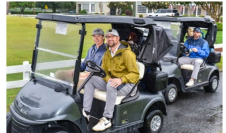
Golf Classic - Greenville Country Club

The Open Fore Business Expo and Golf Tournament , presented by Optimum Business , was held on May 19, 2023, at Greenville Country Club. The event provided participants with a great opportunity to network and learn more about some of the products and services offered by local businesses. Twenty-two teams competed in a Captain's Choice format and vendors (12) were stationed at each hole on the course, along with other vendors at various locations around the clubhouse.